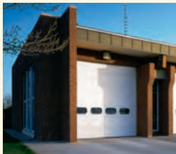
Thermacore® Sectional Doors