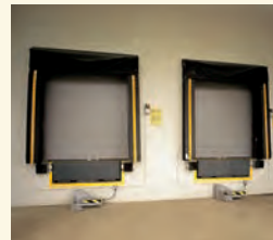
Rolling Service Doors