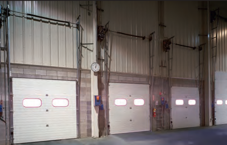
Installation and Service: Overhead Door Company of Twin Falls