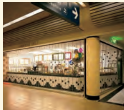
Rolling & Side Folding Security Grilles & Closures